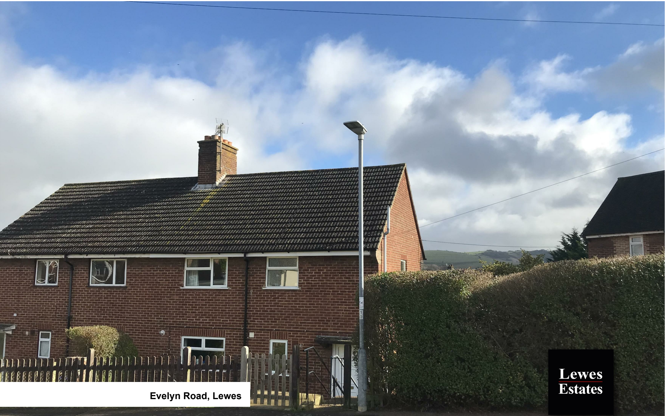
Evelyn Road, Lewes